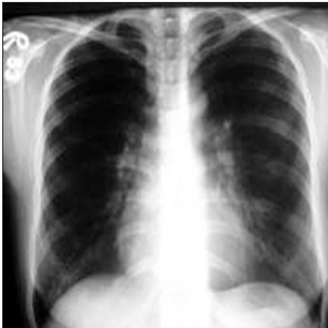
Figure 3. Chest X-ray after treatment.

aled (Figure 3) and total IgE level decreased to 5000 IU/mL. During follow up, IgE level was about 1000 IU/mL. Itraconazole was stopped at second month because of side effects. Steroid doses were gradually tapered, and stopped at sixth month.