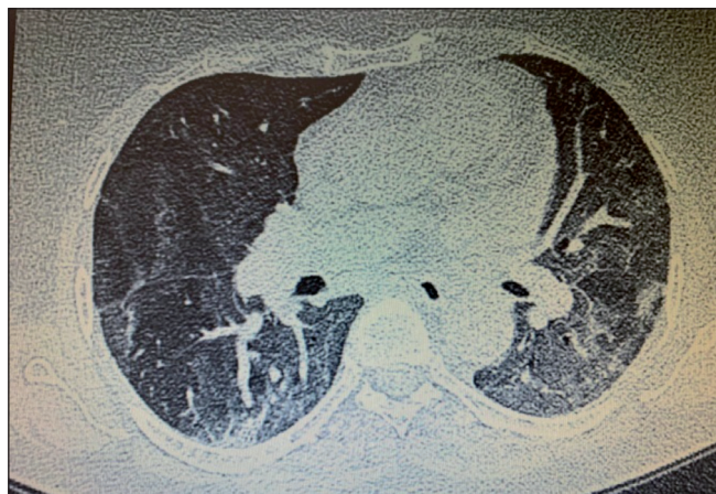
Figure 3. Case 1, thorax CT after treatment.

Lanadelumab is a monoclonal antibody against plasma kallikrein. Although plasma kallikrein is necessary for the breakdown of high-molecular-weight kininogen into BK, plasminogen activates plasmin and affects the fibrinolytic pathway, leading to fibrin destruction (30,