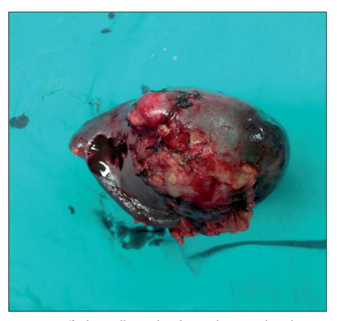
Figure 2. Off-white/yellow-colored cystic lesion in the spleen.

The dimensions of the spleen were 18x11x9 cm. The integrity of the splenic capsule was disrupted, and there was an off-white/yellow-colored cystic lesion that measured 7x6x6 cm (Figure 2). By microscopy, a calcified cystic lesion with a germinal membrane and cuticle was observed in the splenic parenchyma, and numerous scolexes were present in the cyst.